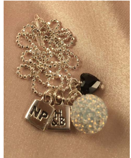
The necklaces come with a standard-length silver chain, 10mm white sparkle ball, silver tag engraved with the H&B insignia and RN, RN/NP or RPN, as well as a heart-shaped black crystal or burgundy crystal sphere for the respective designation.

Place your order today! Orders will be ready for pick up at Annual Meeting or at the SUN Regina office mid to late April.